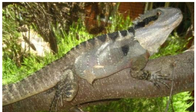
Figure 6 – Adult Male Eastern Water Dragon

While water dragons are very sociable creatures and may live in large groups in the wild, in captivity due to the reduced territorial area you need to be careful of fighting and aggression, primarily between males. It is not recommended that more than one male be kept together in an enclosure, as fighting over territory, especially around breeding season will result in substantial damage and trauma to one or both of the lizards. Remember that the losing male has nowhere to hide, and will be badly harassed. The submissive male may also stop eating. For these reasons it is strongly recommended