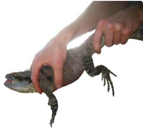
Figure 9 - How to handle a flighty Water Dragon