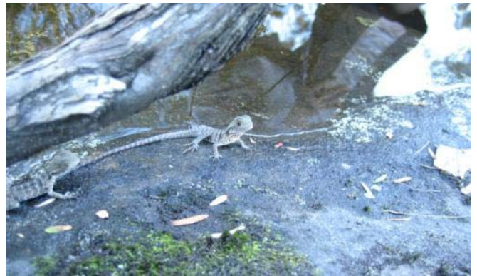
Figure 3 - Hatchling water dragons