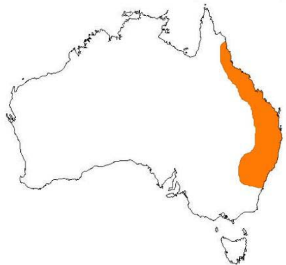
Figure 1 - Approximate distribution of Eastern Water Dragons

The Eastern Water Dragon ( Physignathus lesueurii lesueurii ) is a large, sturdy lizard that lives along the waterways of the Eastern Coast of Australia down as far as the South Coast. They can grow to over one metre long, and is the largest member of the dragon family (Agamidae) in Australia. They are known to have a long life span, with reports of animals living for over 25 years. This should be taken into account if you are considering a water dragon as a pet; they are a very large, long term commitment!