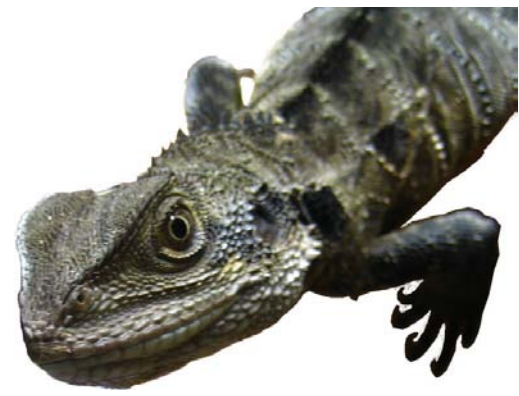
Figure 7 - Female Eastern Water Dragon

that males be separated. Females on the other hand are usually fine in larger groups with a single dominant male, however you should watch closely to make sure that all dragons are getting enough food, as a hierarchy will become established even among the females and sometimes there can be bullying.