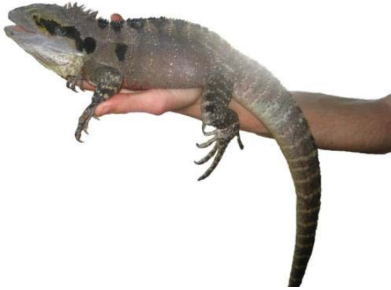
Figure 8 - How to handle a tame Water Dragon