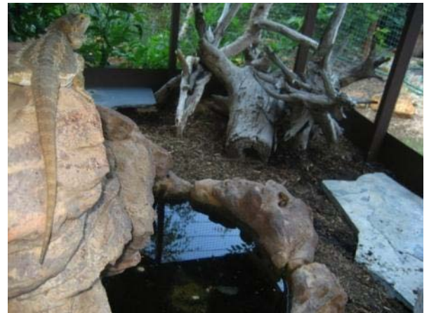
Figure 4 - An example of an outdoor enclosure, with a pond that is the absolute minimum size